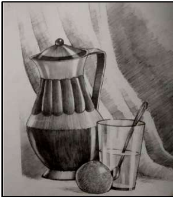
(a) Still Life