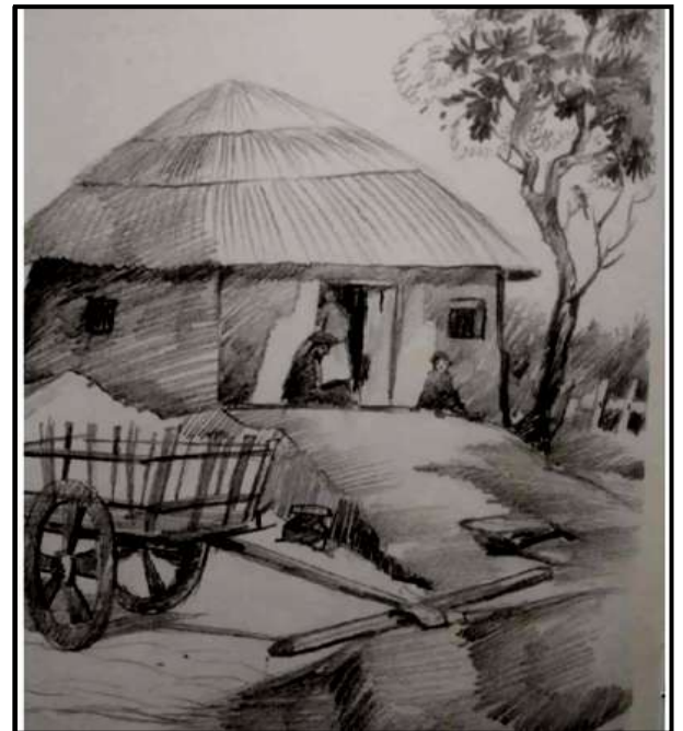
(b) A Village Scene